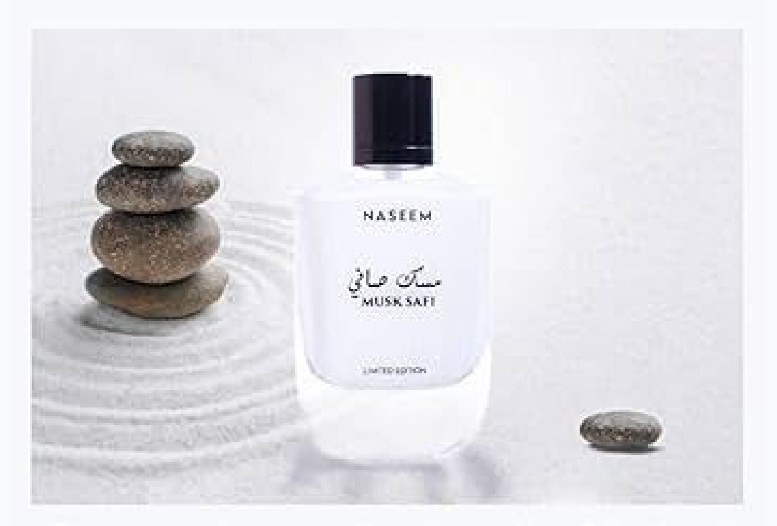
Being our longstanding bestseller, Musk safi is sure to get you the most compliments.

Best For: Everyday wear and romantic evenings.